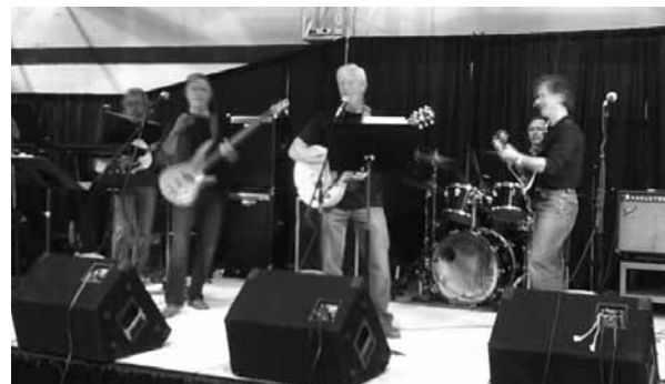
The Chevrons performing at the 2010 Holy Name Harvest

The Holy Name Community is grateful to The Chevrons for their donation of time, talent and treasure making our 2010 Harvest event so special!